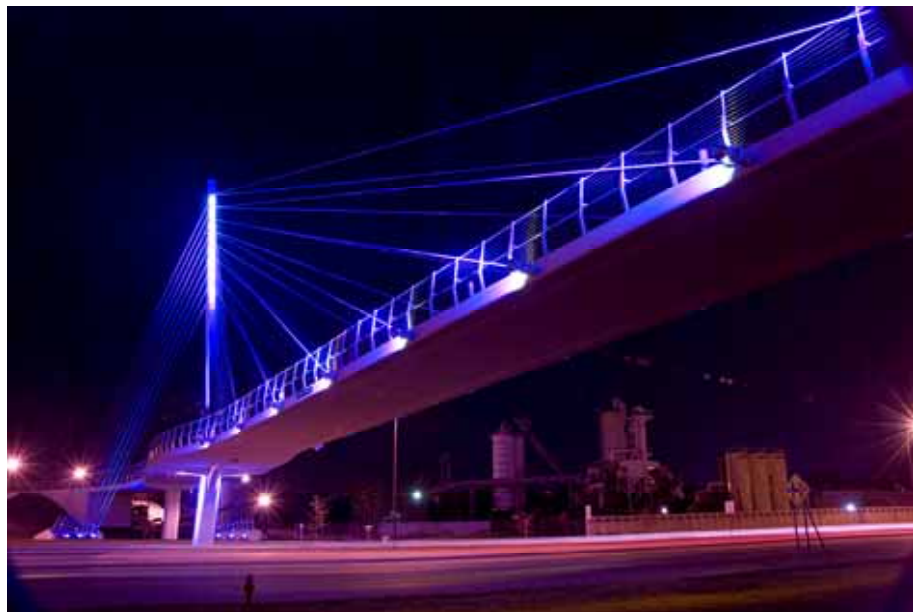
Martin Olav Sabo Bridge