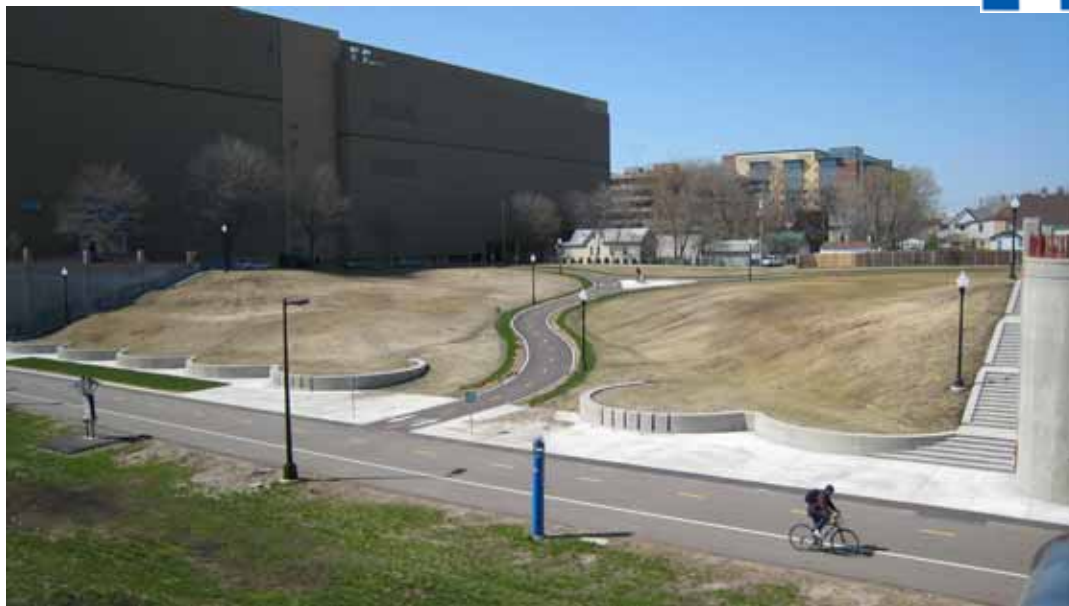
Cepro Ramp Access